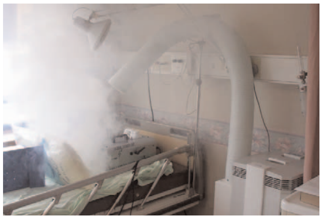
Testing the IQAir® in location. Artificial smoke is generated on a hospital bed and then captured at source with the help of the IQAir® FlexVac™s flexible suction arm.

Thanks to the professional effort of a Hong Kong based authorised IQAir<sup>®</sup> dealership and IQAir<sup>®</sup>'s previous experience in the field of hospital infection control (see IQAir<sup>®</sup> press release "Decentralised Airborne Infection Control in Health-Care Facilities"), IQAir<sup>®</sup> was able to develop a tailor-made SARS control solution for the hospitals managed by the HKHA.