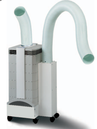
The customised IQAir® filtration solution for the Hong Kong Hospital Authotrity combines an IQAir® filtration system with the FlexVac<sup>TM</sup> source capture kit and special flexible OutFlow<sup>TM</sup>.

filtration process. At the final filtration stage IQAir®'s independently type-tested HyperHEPA® filter removes even the tiniest of airborne microorganisms, including the SARS virus, with an efficiency in excess of 99.5%. As a result the risk of infection within the patient's room can be greatly reduced, thus providing a safer working environment for health-care personnel and limiting the risk of spreading the disease.