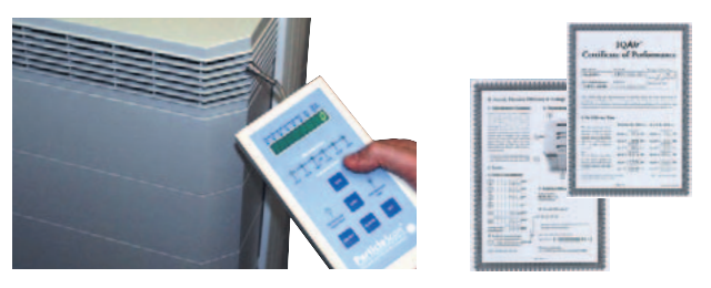
Each IQAir® HEPA filter system is individually tested for filtration efficiency and air delivery. The actual test results are documented on a numbered test certificate.

The efficiency tests revealed that most of the air cleaners failed to remove airborne particulates with the required actual efficiency in excess of 99.97% for particles of 0.3 µm and larger. With its certified and independently typetested filtration efficiency IQAir® passed this test. After the preliminary selection process, it was the EMSD's aim to select an infection control system that could be put into action in a matter of minutes and that would be able to effectively limit the threat of airborne disease transmission from a SARS patient to health-care workers by providing reliable and certified actual filtration performance.