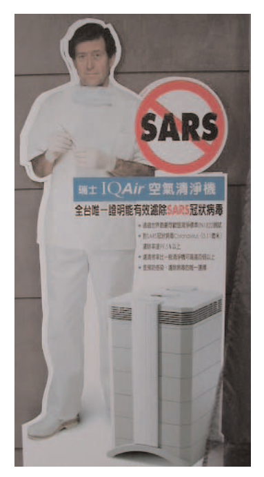
Taiwanese IQAir® display.

It is clear that vigilance for SARS must be maintained, because resurgence of the virus is possible. As a world leading manufacturer of mobile air cleaning systems IQAir<sup>®</sup> feel honoured and privileged to be able to play an important part in providing professional air cleaning solutions for the fight against SARS and other airborne infection control challenges.