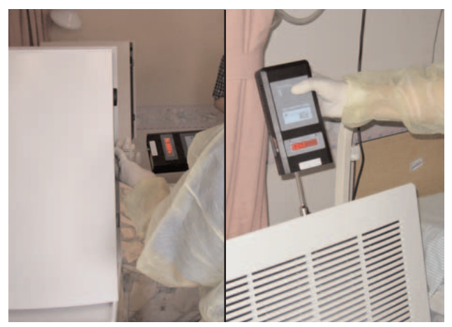
A Senior Engineer of the EMSD assesses the actual filtration efficiency of two air cleaners with a laser particle counter. The majority of conventional air cleaners failed the efficiency test.

In order to find the most efficient, reliable, flexible and cost effective solution, the Electrical and Mechanical Services Department (EMSD) of the Hong Kong Government performed rigorous tests on behalf of the HKHA. They evaluated the suitability and performance of many filtration systems, including IQAir<sup>®</sup>. With the help of a laser particle counter the EMSD tested the actual filtration efficiency of each filtration system.